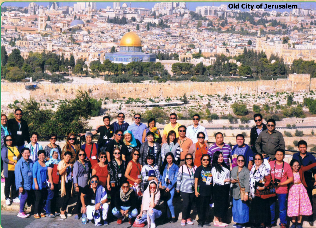
Old City of Jerusalem

2026 SCHEDULED DEPARTURES: Sep 01-13 • Sep 08-20 Oct 06-18 • Oct 13-25 • Oct 20 to Nov 01 • Nov 03-15 • Nov 10-22